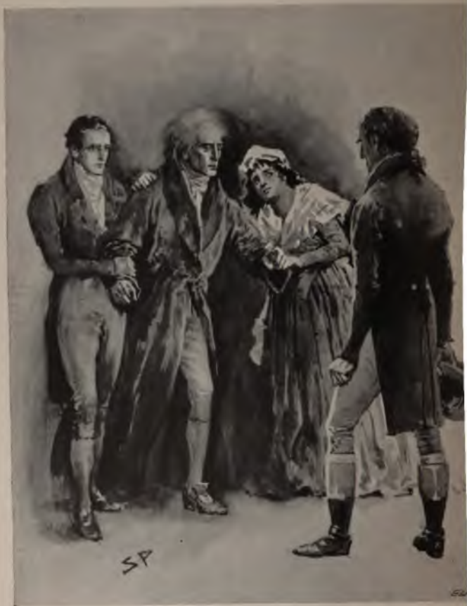
Lord Avon staggered forward.